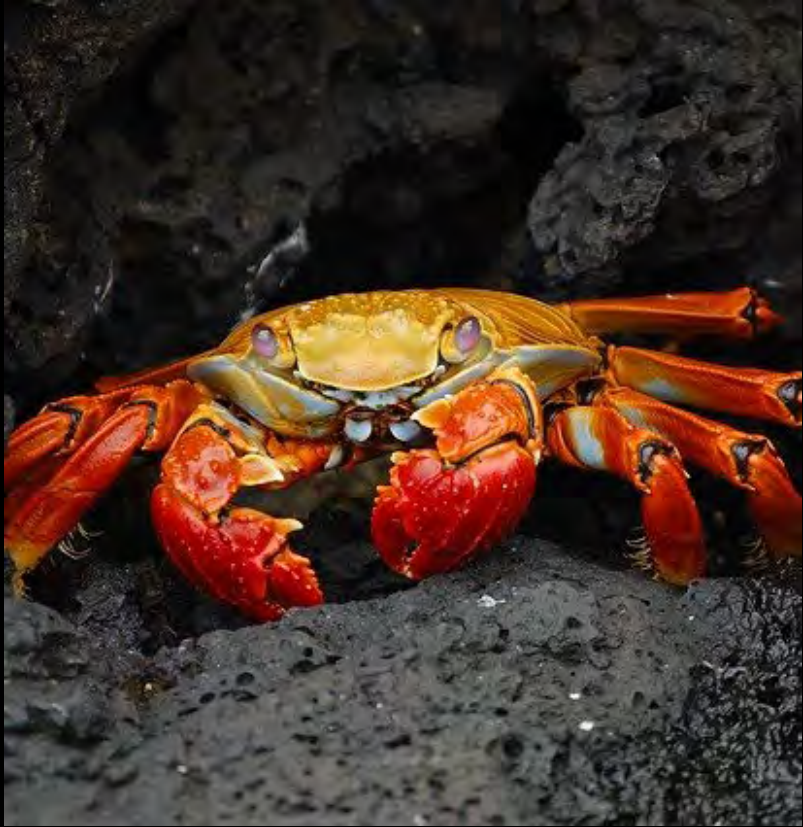
What's the link? Crab